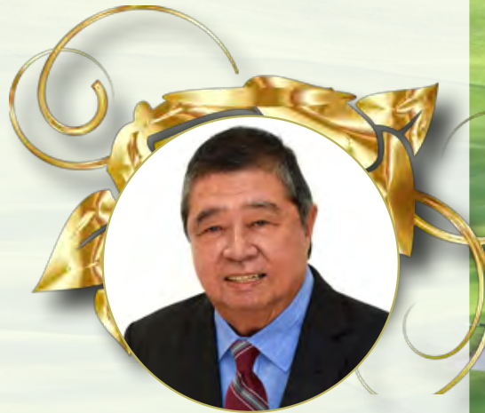
Tun Dr Ling Liong Sik

I would like to thank Sungai Long Golf and Country Club, all distinguished golfers, sponsors and donors for responding to our invitation to participate in this Charity Golf Meet. We appreciate all of you coming together to enjoy a game of golf over a good cause for UTAR Hospital.